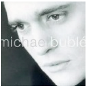
Michael Buble Tickets

2nd On Line Auction Opens at 6:30 Tonight! NEW ITEMS ADDED!