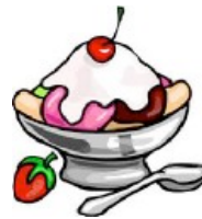
Classroom and Teacher Parties