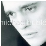
Michael Buble Tickets