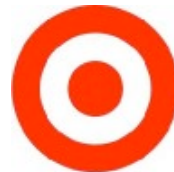
TARGET Gift Certificates

To enter the on-line auction, go to http://stalphonsus.maestroweb.com/ (do not type www prior to the website address).